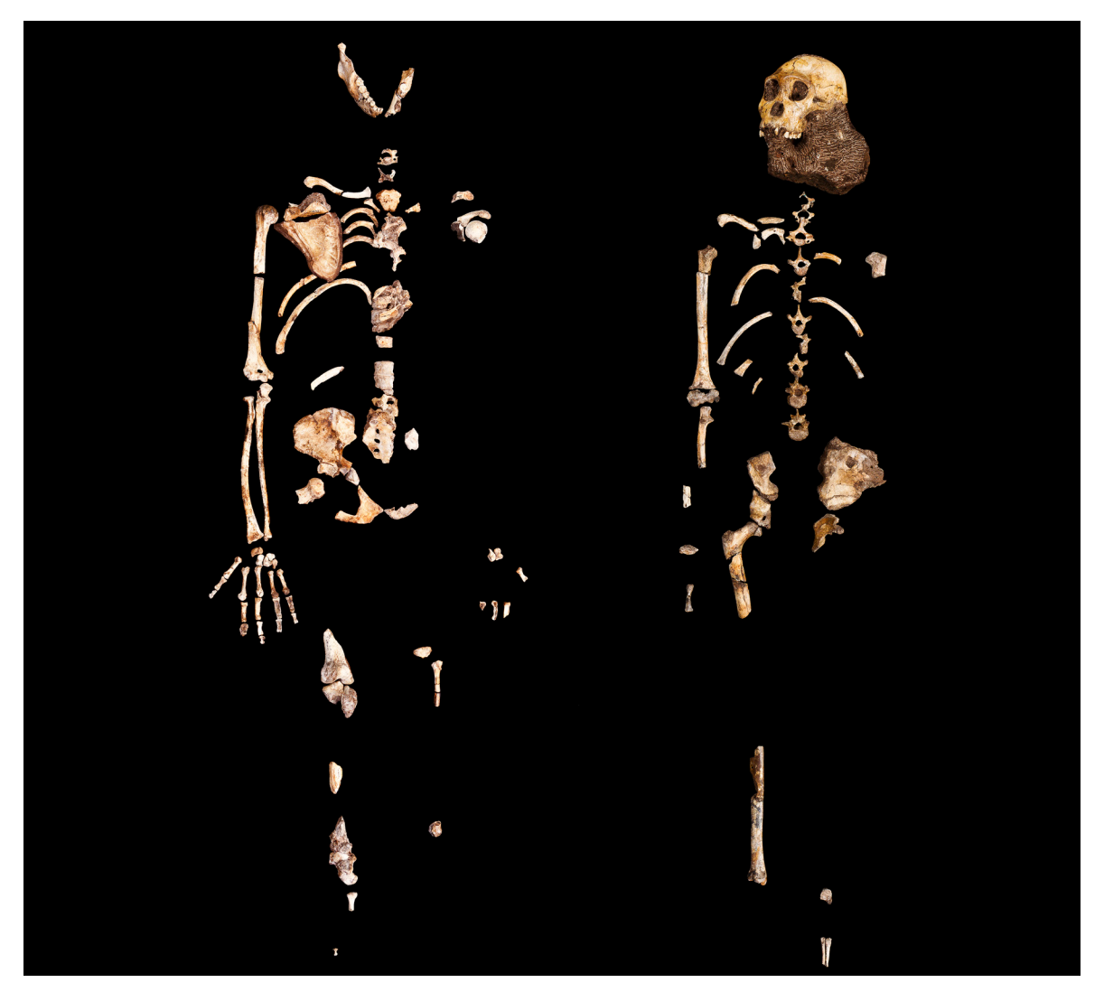
Figure 2. Malapa Hominins 1 and 2 associated fossils in approximate anatomical position. Adult female MH2 is shown on the left, juvenile male MH1 on the right. Note that the tibia positioned with MH1 is thought to belong to another proposed individual, MH4.

Au. sediba shares with members of the genus Homo , encompassing a variety of distinct functional systems, suggests to these authors that Au. sediba represents a candidate ancestor to the genus Homo , or a close sister-group to that ancestor. Williams and colleagues describe the postcranial axial skeleton—sternum, vertebrae, and ribs. They find that the Au. sediba vertebrae are among the most diminutive in the hominin fossil record. Additionally, Williams et al. challenge the notion that the Malapa assemblage represents more than one species, showing that there is no convincing evidence for this contention; rather, the postcranial axial material at Malapa is best understood of as the remains of two individuals, one adult (MH2), one juvenile (MH1) of the same species, Au. sediba .